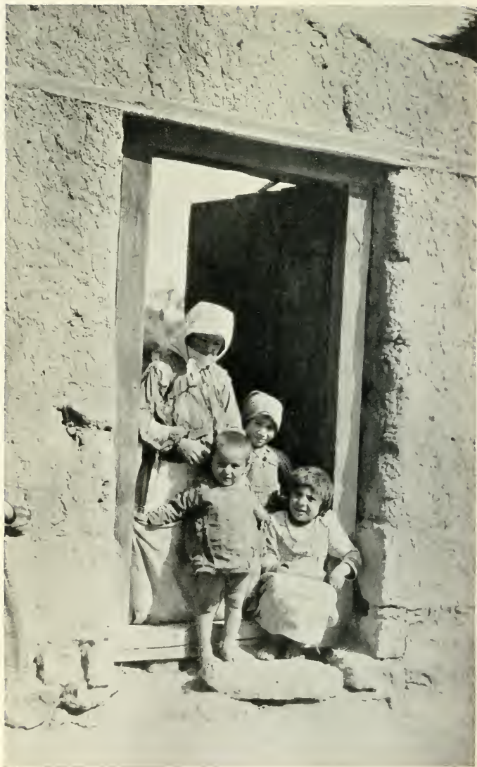
ARMENIAN REFUGEES FROM TURKEY ARRIVED IN RUSSIA